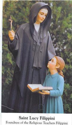
Saint Lucy Filippini Foundress of the Religious Teachers Filippini

Lucy Filippini was born on January 13, 1672, in Corneto-Tarquinoa. She had not yet reached her first birthday when her mother died and was buried in the Church of San Marco. Her father, whom she loved dearly, also died six years later and was buried in the Church of Santa Margherita in Corneto. Now orphaned, Lucy went to live with her aunt and uncle. As a child, Lucy would prepare small altars and pray devoutly.